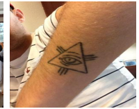
iContribute: Show Us Your Ink