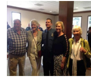
iContribute News Photos